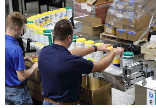
Shuttleworth Product Delivery Conveyor