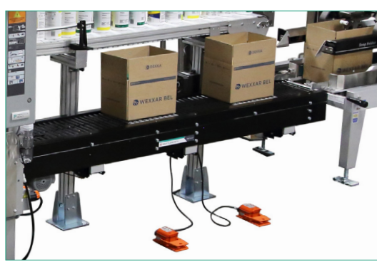
Two Person Pack Station