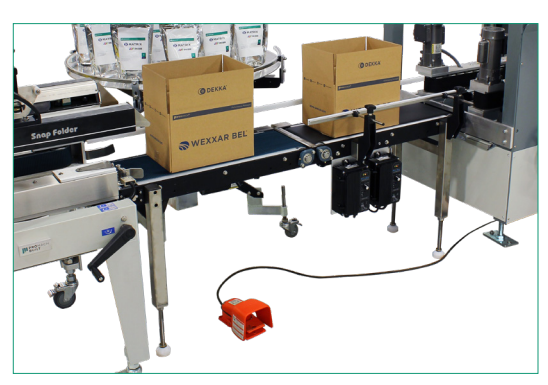
One Person Pack Station

Wexxar Bel's case delivery conveyors provide quick and easy 2-handed case loading. Operators utilize an ergonomic foot switch for automatic case indexing. Depending on your desired throughput speed, floorspace and more, the conveyors are available in 1 or 2 person configurations.