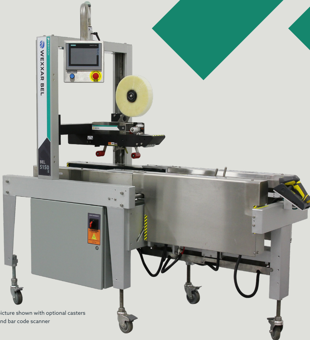
*picture shown with optional casters and bar code scanner