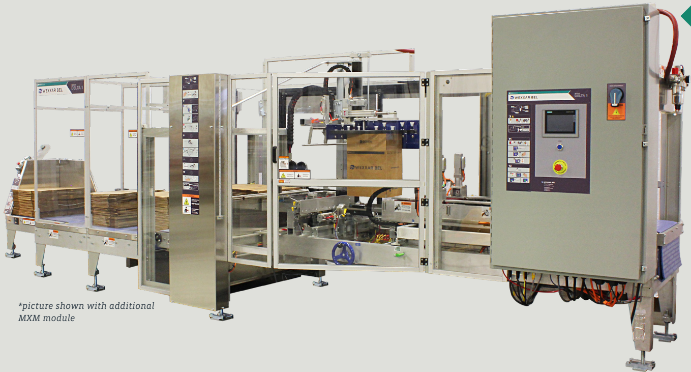
*picture shown with additional MXM module