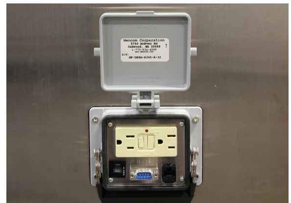
External Power and Ethernet Outlet